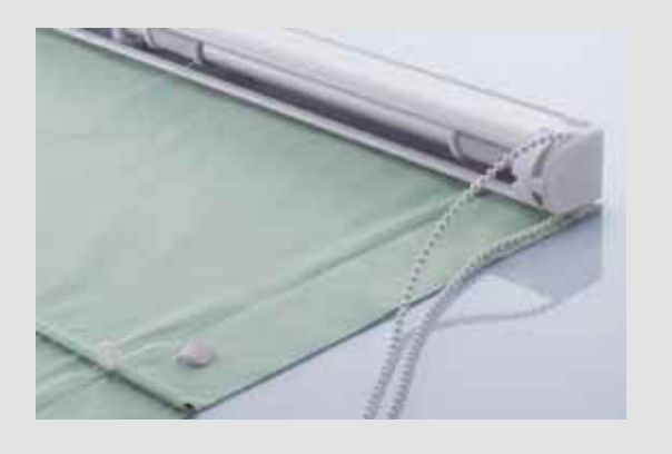
Another option for Roman blinds is to use a tape system. Silent Gliss offer systems supplied with cassettes preloaded with tape.

By enclosing the mechanisms inside a discreet headbox you can ensure the function of the blind cannot be seen from either side of the fabric.