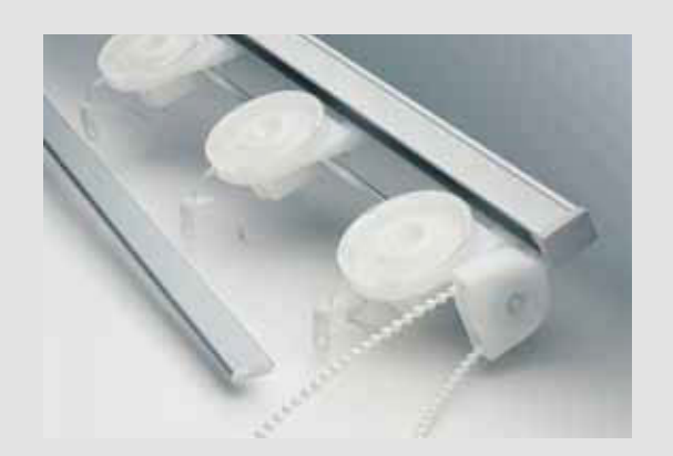
Please see application charts at the back of this brochure for full range details.