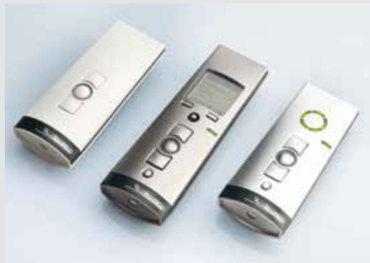
Remote controls Silent Gliss 9940