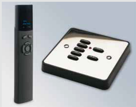
Remote controls Silent Gliss 0450

Our Customer Services team will be on hand from the start to offer expert advice on the most appropriate systems, control combinations and wiring for your project.